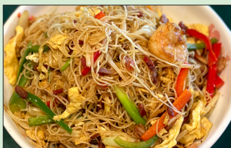
Singapore Rice Noodle