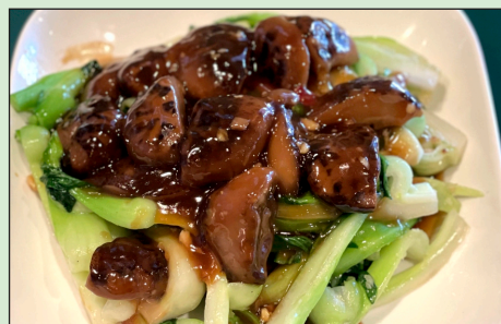
Baby Bok Choy w/ Shitake Mushroom