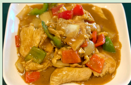
Thai Curry Chicken