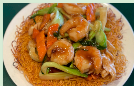
Hong Kong Style Chow Mein