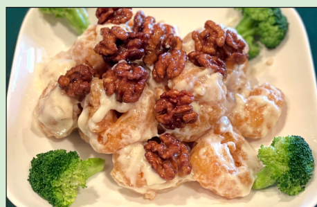
Honey Walnut Shrimp

Shrimp and walnuts in a creamy white sauce