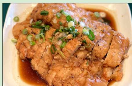
House Special Chicken