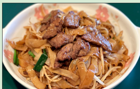
Beef Chow Fun