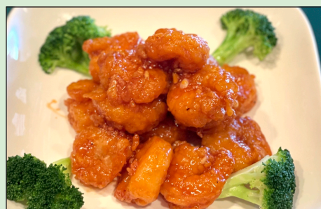
Golden Wok Shrimp

Shrimp with mushrooms, onions and water chestnuts in a brown garlic sauce